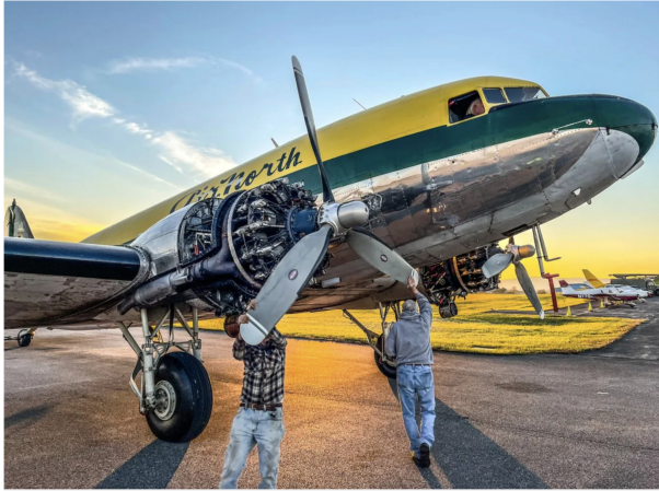
The restored DC-3, known as the Yukon Sourdough, in Maryland.