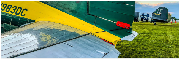
The Yukon Sourdough at this year's EAA AirVenture Oshkosh. Air North DC-3 Yukon Sourdough/Facebook Photo

The question remains if the plane will ever make its way back to the Yukon.