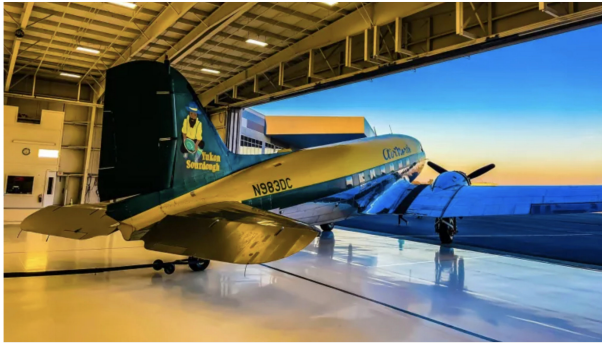
The restored Air North DC-3 in a hangar in Hagerstown, Maryland.

The aircraft was originally built in 1942 as a C-47A Skytrain. In 1982, it was purchased by Air North, registered as CF-OVW — a Douglas DC3C-S1C3G — and operated with the name and tail art "Yukon Sourdough." Air North sold the plane in 1998, and in 2001, it was picked up and partially restored by the Experimental Aircraft Association (EAA) in a hangar at Oshkosh, Wisconsin.